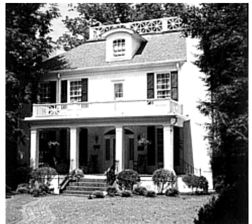
The Cherry Mansion in Savannah sits on the remains of a prehistoric mound.

In addition to the Shiloh site, the chiefdom included six smaller towns, each with one or two mounds, and isolated farmsteads scattered on higher ground in the river valley. Downstream on the river's eastern bank, Savannah, Tennessee, marks the site of another palisaded settlement with multiple mounds. Many of the Savannah mounds were actually built much earlier, about 2000 years ago, but the site was reoccupied at roughly the same time as the Shiloh site. We don't know whether these two towns were occupied at exactly the same time. Modern buildings in Savannah have obliterated most of the prehistoric site.