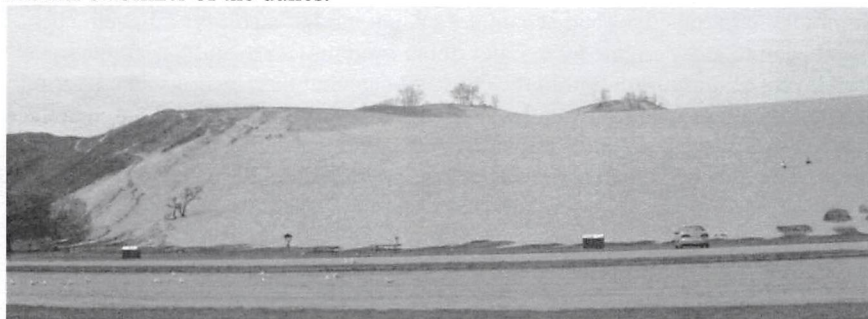
The Dune Climb (late fall). Notice the Cottonwood trees on the left and at the top of the dunes.

dune slope. At the crest of the dune, you can see the tops of cottonwood trees, another stabilizer of the dunes.