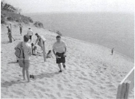
Perched Dunes at Lake Michigan Overlook

Some of the most prominent features in the park are the perched dunes. These are not ordinary beach dunes. They are high dunes perched on top of already high glacial moraines. The moraines are the great ridges of material that the glaciers pushed before them and then deposited when they halted and began to recede. As waves and wind along the lakeshore cut away the headlands of the glaciers, the wind blew the lighter sands higher up on top of the moraines. The heavier stones fell down toward the beach. This continual sifting process can be experienced on a windy day from the Lake Michigan overlook on the Pierce Stocking Scenic Drive. You will see and feel the sand blowing upward and you may carry some of it away in your eyes, ears and hair.