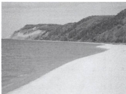
Coastal bluffs north of Esch Rd.

Glacial ice, like water, seeks valleys and lowlands. The front of the ice takes on a lobate shape as it conforms to the terrain. Imagine glacial ice twice as thick as the highest hills you can see. As the ice melted, the runoff waters carried sand and gravel that had been frozen into the ice. This debris was deposited between lobes of ice to form highlands. Looking north from Platte River Point, you can see two such highlands: Empire Bluffs and Sleeping Bear Bluffs. The pattern of bay and bluff is repeated along the park's entire shoreline, reflecting the earlier array of ice lobes and interlobate moraines.