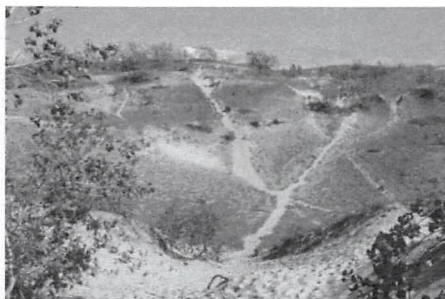
Trail from Dune Climb to Lake Michigan

If you are prepared for a strenuous hike, the 3.5 mile round trip walk up and down through the dunes to Lake Michigan will give you a good idea of the immensity of this perched dune area. Be sure to wear good shoes and take plenty of water.