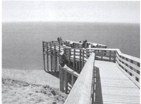
Lake Michigan Overlook on Pierce Stocking Drive

Continue along the Scenic Drive to Stop #9. Take the short walk to the observation deck of the Lake Michigan Overlook where you will see the beach 450 feet below. Notice the composition of the bluff below your feet. While many people assume this is a dune, you will notice the rocks and gravel mixed with sand which indicates it is a moraine created from debris pushed up by the action of the glaciers. On a