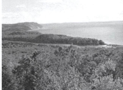
North Bar Lake and Empire Bluffs in the background as seen from Pierce Stocking Drive.

Follow M-22 into Empire past the junction with M-72 and when the road veers to the right, go straight on Lacore Street, and follow it to the end. Turn right on Voice Road, then left on Bar Lake Road until you arrive at the parking lot for North Bar Lake on your left. There is a vault toilet at the parking lot. Take the short hike to the lake and follow the boardwalk over the beach dunes to Lake Michigan.