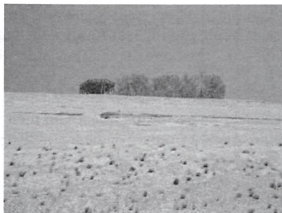
Lake Michigan Overlook on Pierce Stocking Drive looking up from the beach.

As you travel around Sleeping Bear Dunes National Lakeshore and northern Michigan, think about ice... A lot of ice. Standing on the Lake Michigan beach at the base of the Sleeping Bear bluffs just north of North Bar Lake, you can look up to the observation deck on the Pierce Stocking Drive 450 feet above. During the last ice age the glaciers here were 7 to 10 times as high as those bluffs. The ice was a mile thick in some places!