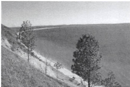
Lake Michigan from the top of a coastal bluff.

The Great Lakes basins filled with melt water as the glaciers receded. As the rapidly melted from the ice lobe in Sleeping Bear Bay it could not flow north because of the remaining glacial ice. A river carried this water south from present day Glen Lake, along where M-22 is now, around Empire and finally into the Lake Michigan Basin by Otter Creek. You can see this glacial drainage channel, which is now dry, as it crosses M-22 at Stormer Road just south of Empire. You will get an idea of the immense volume of melt water it once carried.