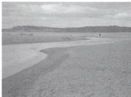
Platte River where it meets Lake Michigan. Note the sand barrier that directs the river parallel to the beach. Also note the coastal bluffs.

NOTICE: During the spring and early summer, part of this beach may be CLOSED to protect the nesting area of the endangered Piping Plover.