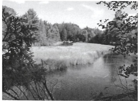
Crystal River from Dunn's Farm Rd.

Drive to Glen Arbor on M-109 until it connects up to M-22 again in town. Continue through town until you see the river on your right side. Turn right on Dunn's Farm Road and you will see glimpses of the river as it turns back on itself several times on it's way to Lake Michigan. The river drains water from Glen Lake following a tortuous path through the troughs between low sand ridges formed by the beaches of ancestral Lake Michigan as it receded.