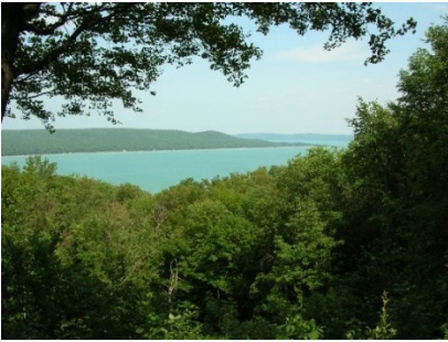
View from the Glen Lake Overlook

After we get done with the Scenic Drive, you can see this area up-close by hiking the Alligator Hill Hiking Trail. It has about 9 miles of trails with some of the best views of Lake Michigan and the Manitou Islands. Pierce Stocking’s old sawmill was located across the road from the trailhead, and you can explore the ruins of the old kiln used to make charcoal from the waste wood from the mill. By the way, there are 13 hiking trails in the park, and there are trail maps at each trailhead. Trails are open all year long, and Alligator Hill is a favorite for cross country skiing and snowshoeing in the winter.