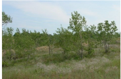
Cottonwood trees, grasses, and other dune stabilization plants.

The dense root networks of various grasses also hold the sand in place. Once the dune is stabilized, new plants can begin growing on it – plants that are not able to survive on an active dune. Common juniper, the evergreen shrub growing among the grasses, is one of the typical plants of stabilized dunes.