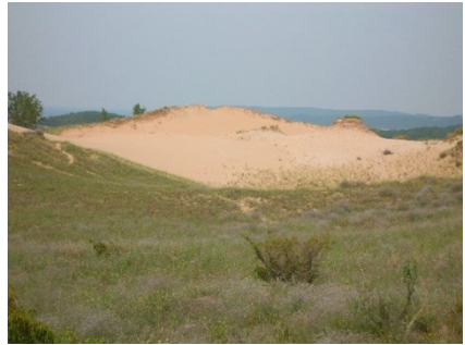
Dune Blow-out with wildflowers in foreground and Lake Michigan in the background.

depending on the time of year you are hiking. There are also cottonwood and birch trees in the dunes. These trees can be engulfed in sand and then many years later, when the sand blows away a ghost forest appears. You will also get a close-up of some large blow-out areas of pure wind-blown sand. Keep your eyes open for animal tracks in the sand revealing the elusive wildlife of the dunes.