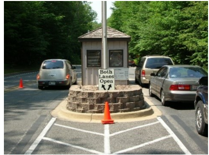
Fee Booth at the entrance of the Drive

The Sleeping Bear Dunes National Lakeshore is operated by the National Park Service, so a National Parks Pass is required for entrance to the Scenic Drive, the Dune Climb, and for parking elsewhere in the Park. If you are planning a picnic lunch while on the Scenic Drive, you'll find two picnic areas (Picnic Mountain between Stops 2 & 3; and North Bar Lake Overlook at Stop 11).