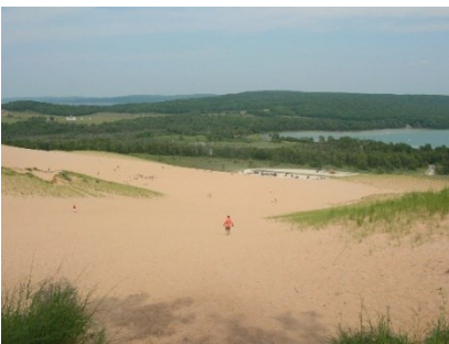
Top of the Dune Climb from Cottonwood Trail

The hike can be strenuous in places because you will be walking through loose sand. Be sure to wear good shoes and carry some drinking water. Watch out for poison ivy, a common native dune plant that can cause skin irritation if touched. Some of our visitors like to hike the Cottonwood Trail to the top of the Dune Climb and have a driver pick them up there. Please stay on the designated trail.