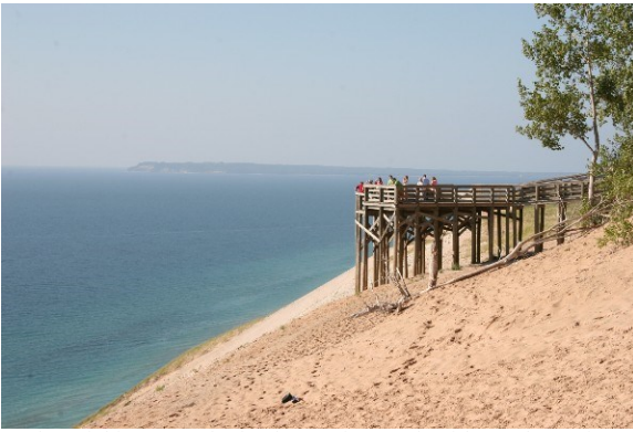
Lake Michigan Overlook Observation Deck with South Manitou Island in the background.

Look at Lake Michigan. Notice the shades of blue caused by the varying depth of the lake along the shoreline. On a windy day, the blues of the lake are accented by the white lines of waves as they roll in and the whitecaps out in the lake. On a clear day, you can see about half of the park from