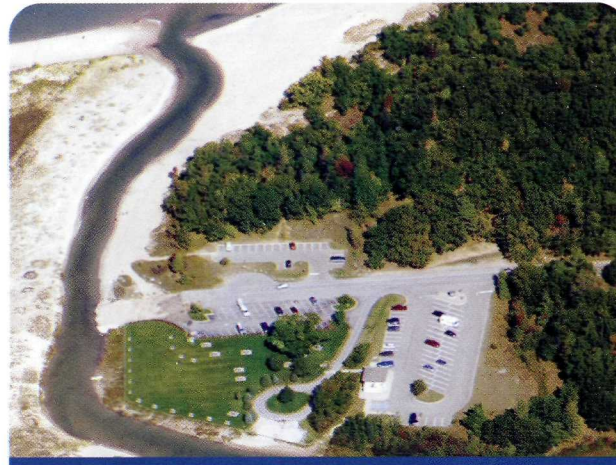
Parking lot at the mouth of Platte River*

Placement & pick-up service for private canoes & kayaks