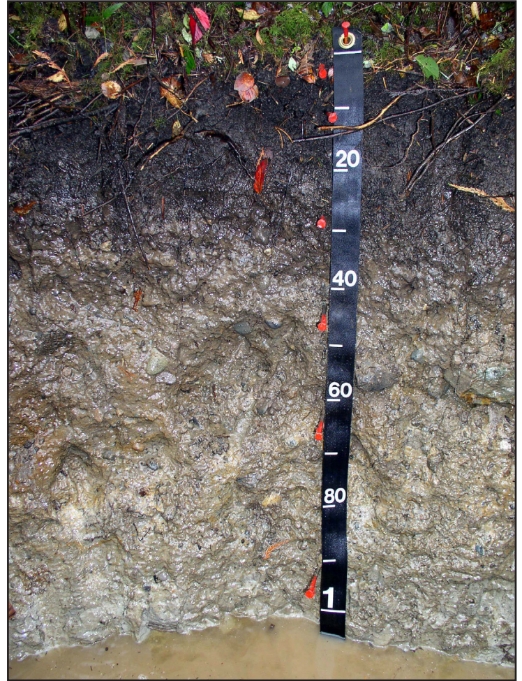
A typical soil profile of Bazal mucky loam from San Juan Island National Historical Park. These are poorly drained soils forming in glacial outwash material over dense glaciomarine deposits and have a seasonal high water table. Numerals on tape are in centimeters.

Working in partnership with the Natural Resources Conservation Service (NRCS), the SRI has completed mapping in 217 park units. Mapping is in progress in an additional 26 units. The NRCS will continue to support soil mapping until the project is completed. Special strategies are being developed in cooperation with the NRCS and private contractors to utilize advanced soil mapping technologies to handle the large-area mapping for parks in Alaska, Arizona, California, Florida, Montana, New Mexico, Utah, and Washington.