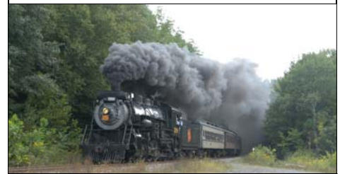
Canadian National #3254 locomotive trails smoke, steam and soot, as it exits the Canadian Pacific Railway's Factoryville Tunnel.

Steamtown National Historic Site, in partnership with the Canadian Pacific Railway, conducted a sell-out excursion to the Tunkhannock Viaduct on September 9, 2007. The Park's last, regularly-scheduled excursion crossed the historic structure ran in 1992. The 40-mile roundtrip excursion followed the former Delaware, Lackawanna & Western Railroad mainline from Bridge 60, and stopped atop the 240-foot high Tunkhannock Viaduct. Passengers were able to experience the spectacular view of the village of Nicholson, celebrating "Nicholson Bridge Day", and the lush surrounding countryside. Taking advantage of the superb weather, local ABC-affiliate WNEP-TV, used its news helicopter to film breathtaking scenes of the train. The excursion proved to be very popular, as guests soon began asking about plans for future trips on this section of the former DL&W mainline. And then, the sound of our Canadian National #3254 steam locomotive whistle echoed through the Endless Mountains to signal our return move to Scranton.