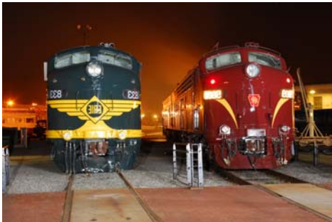
Erie E8 #833 and Pennsylvania Railroad E8 #8509 pose for the Night Photo event at Lackawanna Railfest 2007