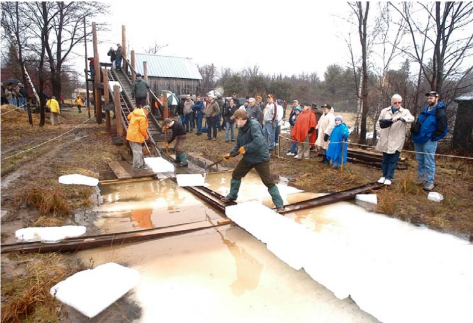
This photo, from the 2005 Ice Harvest at Tobyhanna, illustrates how ice, cut into blocks on Mill Pond #1, was moved to storage at the ice house.

Steamtown National Historic Site's first excursion of the New Year, the Ice Harvest Train, departed Scranton on January 19, 2008 bound for the annual Tobyhanna Ice Harvest. The Martin Luther King, Jr. Weekend train carried passengers from Scranton up onto the Pocono Plateau to the quaint village of Tobyhanna, Pennsylvania.