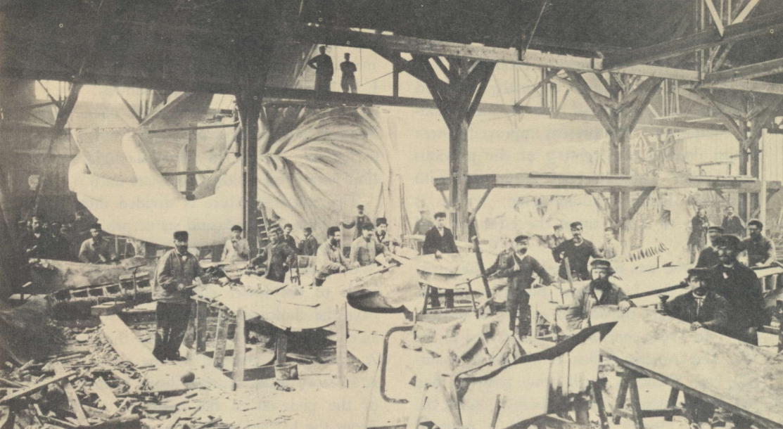
Sheet copper for statue being hammered into shape in Paris workshop.