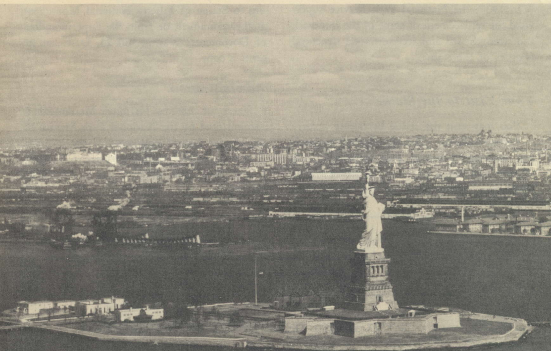
Air view of Statue of Liberty, with Jersey City in background.