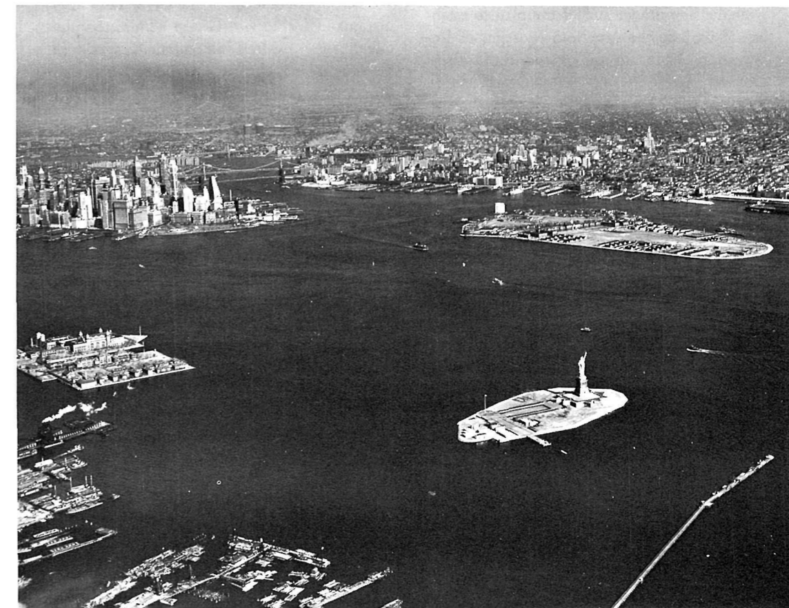
Air view of Statue of Liberty, with New York City in background.

Edouard de Laboulaye did not live to see the work finished, and his place as president of the Franco-American Union was taken by Count Ferdinand de Lesseps, builder of the Suez Canal. Bartholdi was among those present to see President Grover Cleveland dedicate the Statue on October 28, 1886.