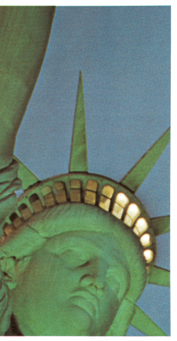
National Monument, New York