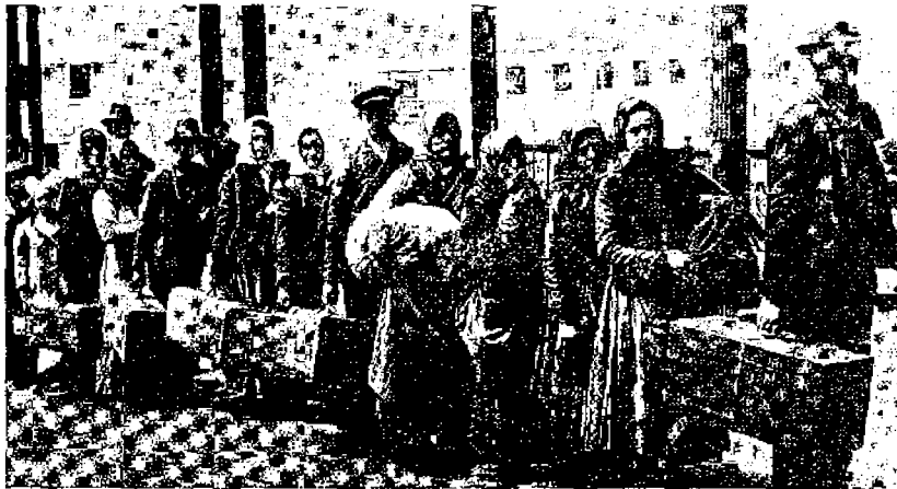
ELLIS ISLAND STATUE OF LIBERTY NATIONAL MONUMENT NEW YORK - NEW JERSEY