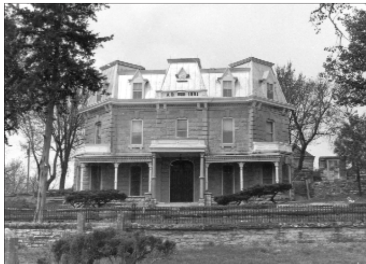
With strong support from Senator Nancy Landon Kassebaum, the bill to create the Tallgrass Prairie National Preserve on the Z Bar Ranch (above) was finally approved on October 4, 1996.

around them, either by design or by accident. Of increasingly common concern, regardless of one’s politics or world view, is the accelerating pace, scale, and effect of human interaction with the natural environment. As a society we confront a mounting list of environmental casualties. How we respond to these casualties affects future generations not only at home but often throughout the world. The implications for action are tough to fathom, but here the Tallgrass Prairie National Preserve offers some reason