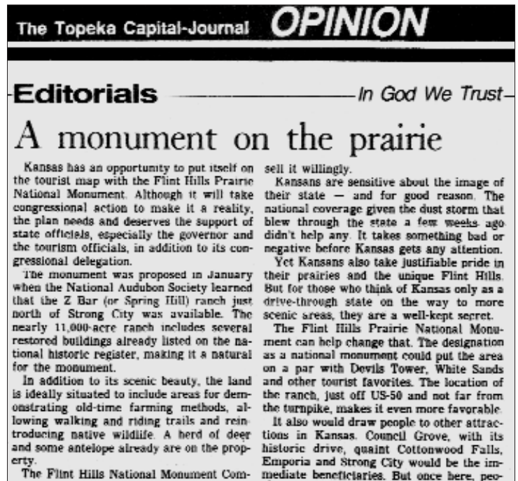
The 1989 proposal to create a national prairie monument on the Z Bar Ranch rekindled the controversy of previous decades and created a flurry of newspaper editorials supporting the movement. The above editorial appeared in the April 5, 1989, Topeka Capital-Journal.

only were they contentious affairs, but an unanticipated twist came when the NPS suddenly reversed its position and opposed the bill, asserting that the eleven-thousand-acre ranch was "not large enough to ensure successful management" and that there had been no "determination of the degree of natural or cultural significance." Glickman was dumbfounded. At a congressional hearing he snapped that the "total conversion of its position" was "one of the most unusual incidents to ever come out of the NPS." 41