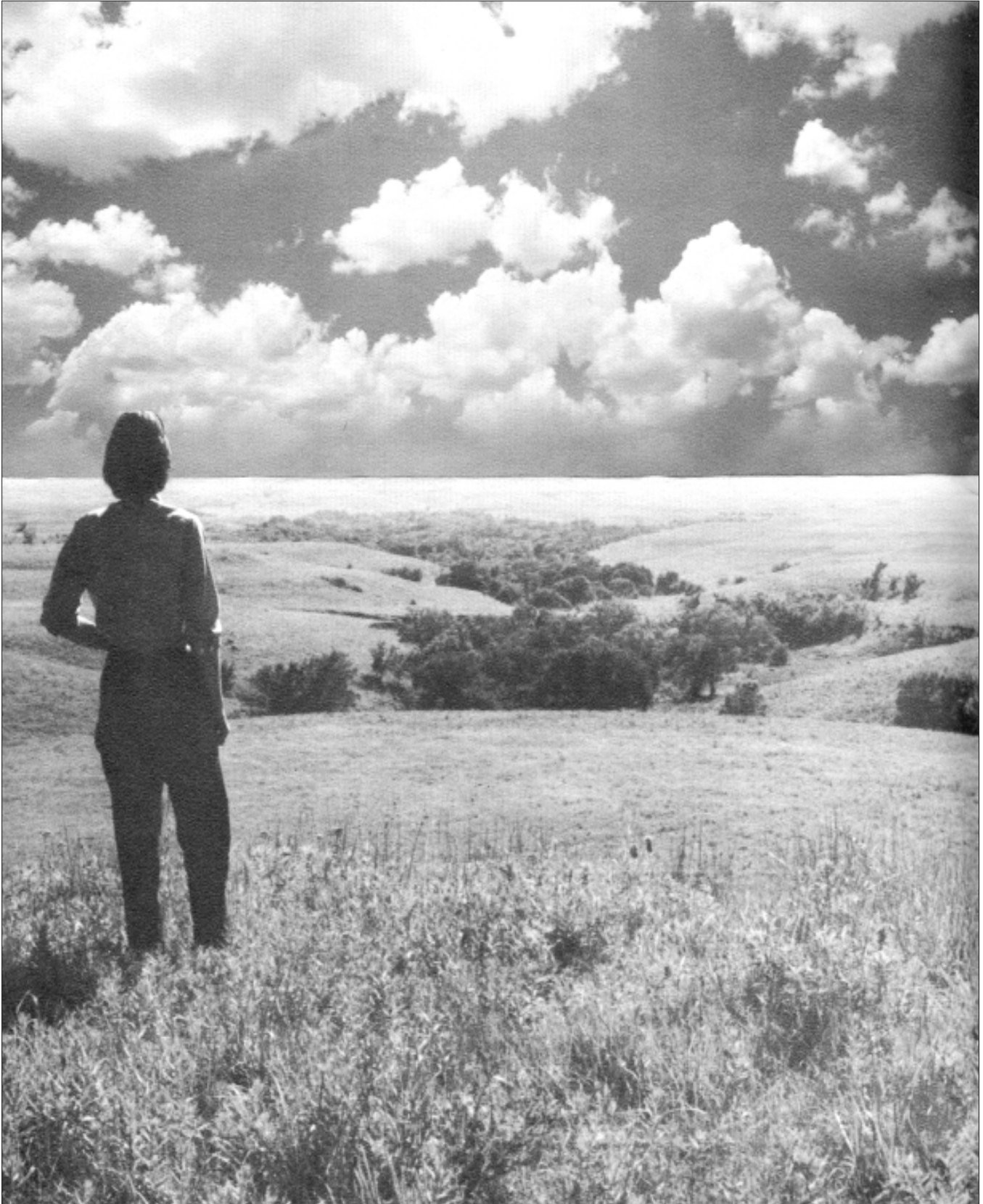
Pondering the prairie. Photograph from A Proposed Prairie National Park, issued in July 1961 by the National Park Service