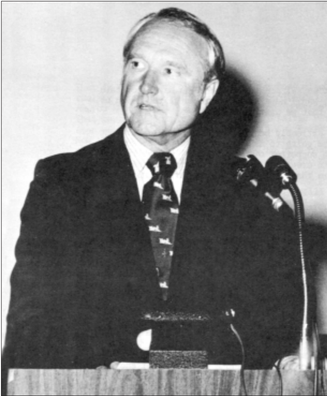
Throughout the 1970s Congressman Larry Winn championed a national prairie park. He is photographed here speaking at the Tallgrass Prairie Conference of 1974, held in Elmdale.

The Tallgrass Prairie Conference of 1974, held in Elmdale appeared to signal an easing of tensions. Co-sponsored by STP, the Kansas Group of the Sierra Club, the Burroughs Audubon Society, the Citizens Environmental