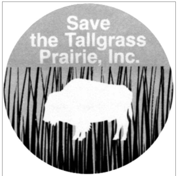
Divided opinion over the creation of a national prairie park spawned a number of political groups, including Save the Tallgrass Prairie, Inc., formed in 1973 by northeast Kansas environmentalists who favored the development of a prairie park.