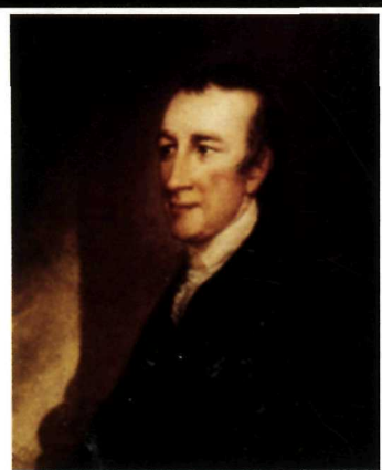
Thomas Stone, signer of the Declaration of Independence