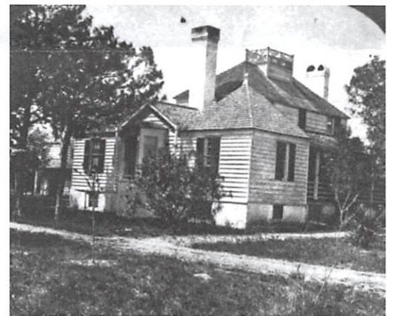
Plantation House, ca. 1870s

The plantation house dates to 1798 and is the oldest plantation house still standing in the state of Florida. It was built for comfort, with four corner rooms and the central two-story section. The stairs to the second floor were located outside on the back porch. The house was designed so that windows on all sides of the rooms would allow breezes to cross-ventilate. Unusual features of the house include the full basement and the widow's walk on top of the house.