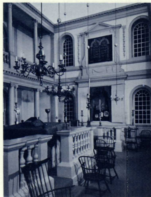
The delicate and ornate interior contrasts sharply with the outward simplicity of the building. Inside the Holy Ark on the far wall are the Scrolls of the Law; above is the painting of the Ten Commandments.

These holy objects, all rich in symbolism, give to the synagogue a profoundly religious atmosphere. The total effect does indeed provide "a faint Idea of the Majesty & Grandeur of the Ancient Jewish Worship mentioned in Scripture."