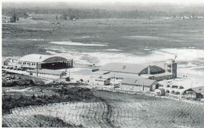
Moton Field, site of primary flight training for the Tuskegee Airmen, also called Airport #2.

Tuskegee Airmen National Historic Site was authorized as a unit of the National Park Service (NPS) by Public Law 105-355, November 6, 1998 to commemorate and interpret, in association with Tuskegee University, the heroic actions of the Tuskegee Airmen during World War II.