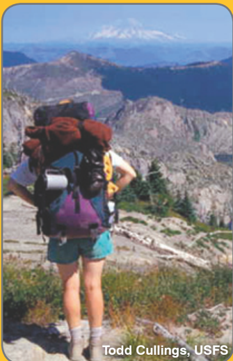
A backpacker looks north into the Mount Margaret Backcountry.

For current updates and permit information please visit: www.fs.usda.gov/goto/backcountry .