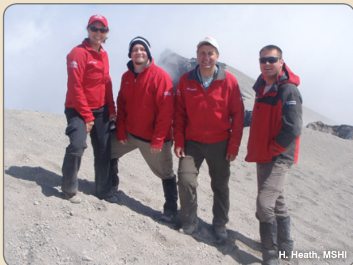
Mountain Stewards on the summit after a successful Mount St. Helens Institute's guided climb, Summer 2010.

Email: info@mshinstitute.org , Phone: (360) 449-7883