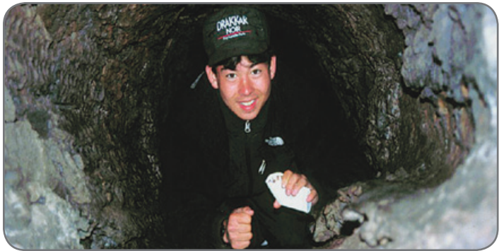
Visitors can crawl through the cast of an ancient tree at Trail of Two Forests.