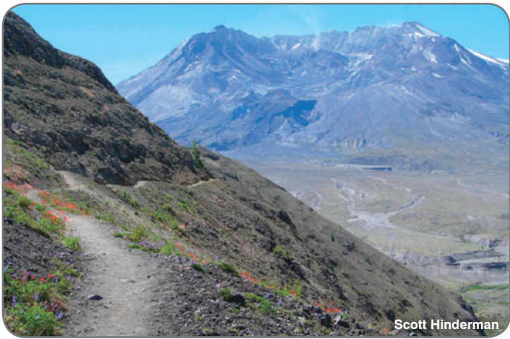
Crater and valley north of the volcano as seen from the Boundary Trail east of the Johnston Ridge Observatory.