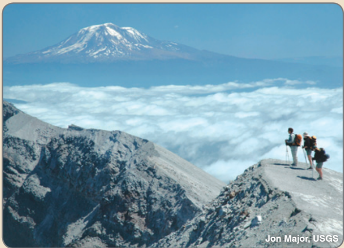
Climbers on the south crater rim with Mt. Adams in the distance. (South side, Forest Road 83)