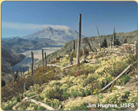
Jim Hughes, USFS

Experience the full impact of the 1980 lateral blast and years of natural recovery as you drive through miles of standing-dead and blown-down forests. View Spirit Lake and the immense floating log mat that is slowly sinking to the lake bottom. Forest Road 99 is generally accessible after snow melts (late June through October; closed in winter) and offers viewpoints, trails, and a gift shop/bookstore. Park Rangers provide engaging talks at Windy Ridge and other viewpoints as well as guided hikes at Meta Lake seven days a week during July and August. A Northwest Forest Pass is required for each vehicle; see page 7 for purchase locations.