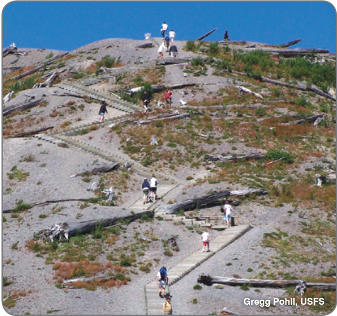
Sand ladder stairway at Windy Ridge Viewpoint. Barren gray area visible along trail is result of damage from off-trail travel.