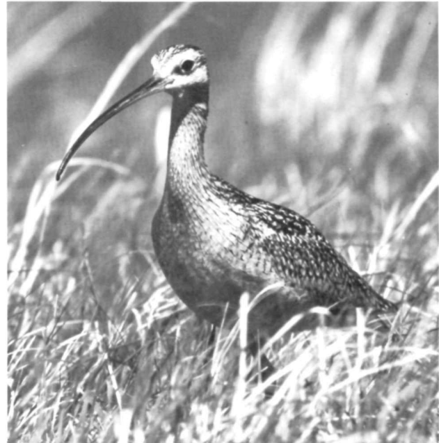
The migrating long-billed curlew returns to Hanford each spring.

Salmon, which die after spawning, wash ashore and become food for another regular Hanford visitor, the bald eagle. Some Hanford scientists believe that eagles may establish nests at Hanford in the future.