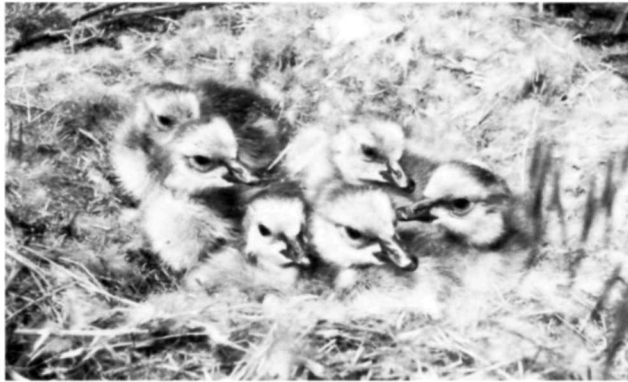
Hundreds of Canada geese are born at Hanford each year. Some of the young birds are tagged by scientists to track their movement.