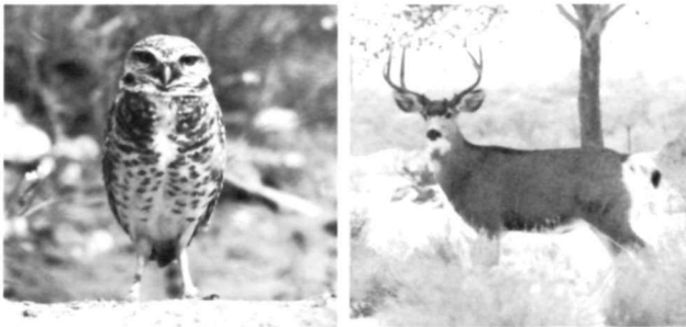
(top) The Swainson's hawk is one of the predatory birds found at Hanford. The burrowing owl nests in holes in the ground (lower left). Several hundred mule deer forage the Hanford range (lower right).