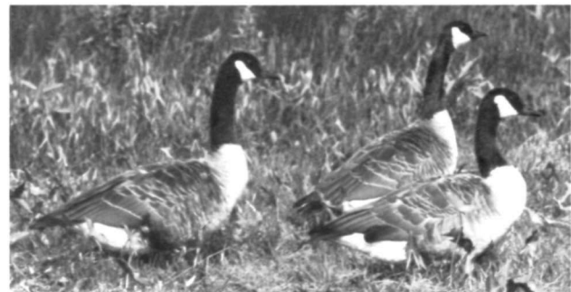
Several hundred Canada geese nest on islands in the Columbia River each year.