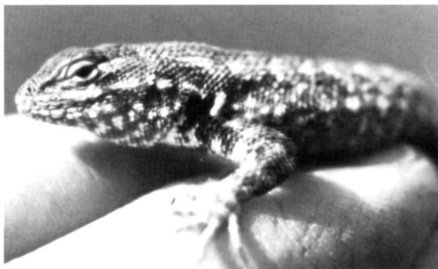
The Sagebrush lizard is a favorite food of snakes and hawks. This small reptile is found only in the very sandy areas of the site.

These studies also provide useful information to evaluate the effects of prolonged exposure to low levels of radiation.