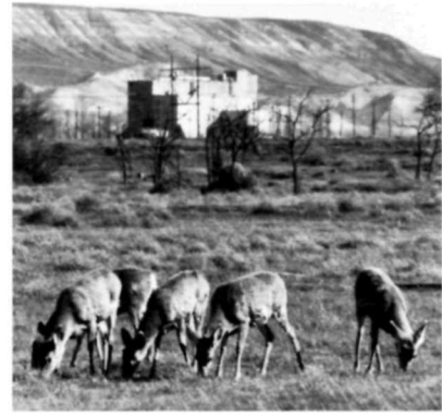
(Left to right) Bald eagles spend the winter at the site. Mule deer graze in the shadow of Hanford reactors.