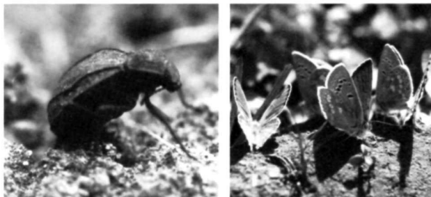
Darkling beetles (left), along with various moths and butterflies (right), are part of a vast insect population.