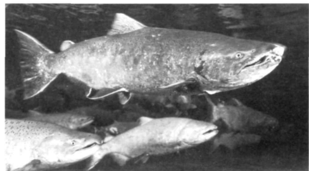
The Hanford Reach is the last main stem spawning ground on the Columbia River for Chinook salmon.