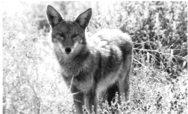
(top left) The pocket mouse is one of Hanford's small mammals. The racer competes with rattlesnakes and whip snakes for food (top right). The predatory coyote helps maintain a natural balance in wildlife populations at the site (bottom).