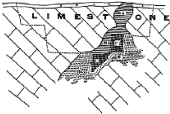
FIG. 11.—THE PORT KENNEDY DORE CAVE.

East and west cross-section of the south end of Erwin's quarry (not drawn to scale for the sake of clearness), showing in the shaded parts A, B, C, D the probable original shape, size and relative position of the cavern. The continuous dotted line shows the area of rock and debris, and a portion of the original cave at present removed by the blasting and excavation of limestone at the quarry.