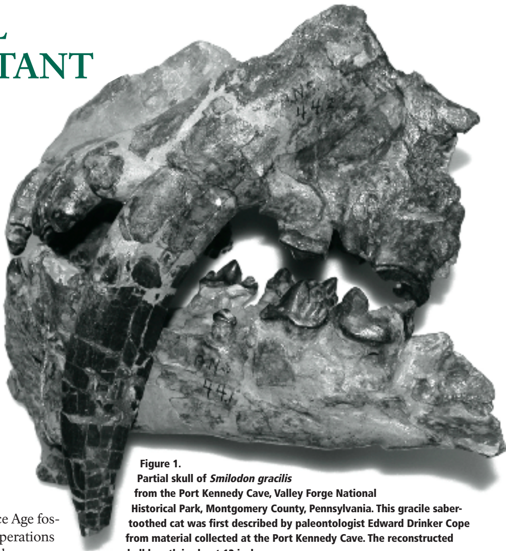
Figure 1. Partial skull of Smilodon gracilis from the Port Kennedy Cave, Valley Forge National Historical Park, Montgomery County, Pennsylvania. This gracile saber-toothed cat was first described by paleontologist Edward Drinker Cope from material collected at the Port Kennedy Cave. The reconstructed skull length is about 12 inches.

The Port Kennedy Cave was actually a vertical solution cavity in Paleozoic limestone that was briefly opened to the surface, forming a sinkhole in the forested Pleistocene landscape. Plant and rock debris accumulated in the shaft along with the remains of hundreds of animals that were trapped or carried to the edges of this sinkhole by predators (Daeschler 1996). Fauna from the site include giant ground sloth, mastodon, tapir, peccary, skunk, short-faced bear, saber-toothed cat, and many other taxa (fig. 1). Site excavations by Wheatley, Cope, and Mercer in the early 1870s and mid-1890s resulted in the collection of more