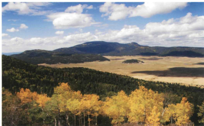
Overlooking the Valle Grande in Valles Caldera National Preserve

Among the newest additions to the National Park System, the 89,000-acre Valles Caldera National Preserve encompasses a dormant volcano that possesses exceptional value in illustrating and interpreting massive explosive volcanic eruptions, caldera formation, and the functioning of active geothermal systems. Its distinct topographic mosaic of expansive valley meadows, or valles (va-yes) in Spanish, lush forested volcanic domes, meandering valley streams, and old growth Ponderosa pine groves are in striking contrast to the arid New Mexico landscape at lower elevations.