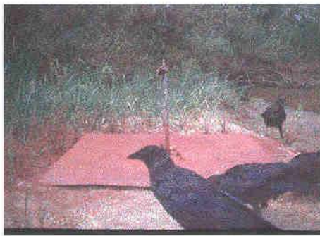
American Crows ( Corvus brachyrhynchos ) Plate #5, August 2000