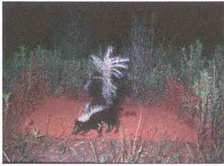
Striped Skunk ( Mephitis mephitis ) Plate #1, August 2000