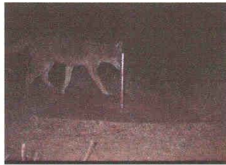
Coyote ( Canis latrans ) Plate #4, February 2001