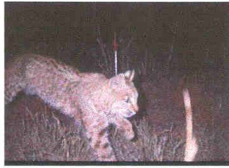
Bobcat ( Lynx rufus ) Plate #2, February 2001