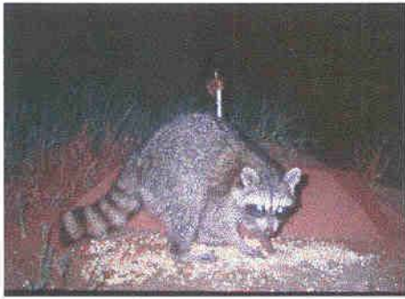
Raccoon ( Procyon lotor ) Plate #5, August 2000