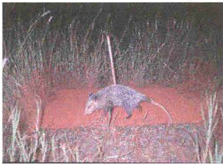
Virginia opossum ( Didelphis virginia ) Plate #3, August 2000