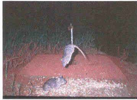
Southern plains woodrats ( Neotoma micropus ) Plate #5, August 2000