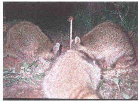
Raccoons ( Procyon lotor ) Plate #6, May 2001