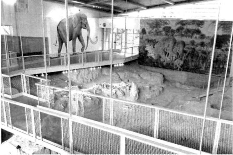
A view from inside the Dig Shelter.

Researchers have dug two quarries here so far. Fossils from the first quarry were moved to Baylor University in 1990. These fossils included fish, turtles, dwarf antelope, American alligator, and 17 mammoths.