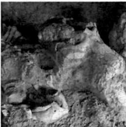
Mammoth W, a female in the upper level.

Mammoths in the second quarry are in two levels. The upper level has four mammoths, including Mammoth Q, a large male. The lower level has mammoths from the nursery herd, a camel, and a giant tortoise shell.