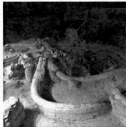
Mammoth Q, a male in the upper level.