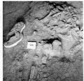
A western camel in the lower level.