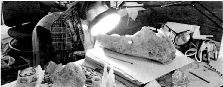
The Geoscientists-in-the-Parks program places students and recent graduates in paid NPS internships. This intern is cleaning fossils in the park's lab.

The site's resources, and the potential for more discoveries, inspire us to explore, appreciate, and ponder the mystery and diversity of life on Earth.