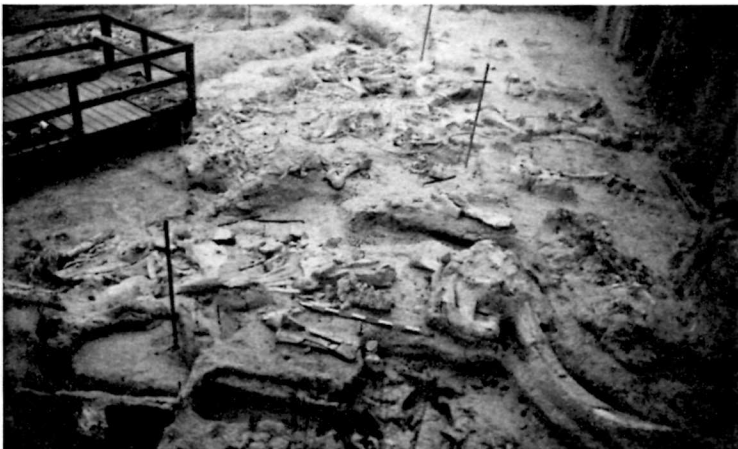
Female mammoths at the Waco Mammoth dig site in 1990.

For instance, evidence at this site suggests females stayed together in a group, called a nursery herd. This matches modern elephant behavior. Elephant herds have a matriarch, the oldest female in the group. This “grandmother” has the most experience finding food and defending against predators. Did Waco’s mammoth herd rely on a matriarch too?