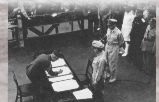
Japanese Gen. Yoshijiro Umezu signs document of surrender aboard USS Missouri , September 2, 1945.