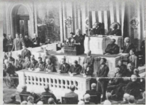
President Franklin D. Roosevelt asks Congress to declare war on Japan, December 8, 1941.

The Pacific Theater of World War II involved one-third of the Earth's surface but only 1/45 of its total land mass. It involved vast distances and new strategy, tactics, equipment, and weapons of war. Moreover, it involved not just Japan and the United States but Great Britain, Australia, New Zealand, the Netherlands, Canada, China, France, and the Soviet Union. Caught in the middle were the people of the Pacific islands, in whose homelands and waters the battles were fought. This chronology tracks significant aspects of the Pacific War as a framework for understanding the people and the events commemorated at War in the Pacific National Historical Park.