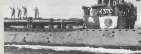
Japanese submarine I-370 carrying Kaiten one-man suicide torpedoes enroute to attack U.S. fleet off Iwo Jima, 1945.

22 July Papuan Campaign begins as Japanese troops land at Gona and Buna, 100 miles east of Lae and Salamaua in northern New Guinea, and begins an overland drive across the Owen Stanley Mountains to capture Port Moresby on the southern coast. In the months that follow, Australian and U.S. forces frustrate every attempt to take the port and eventually drive the Japanese back to Gona and Buna. 7 August U.S. Marines invade Guadalcanal in the Solomon Islands in the first American offensive of the war. Subsequent Japanese efforts to drive the Americans off the island are consistently unsuccessful.