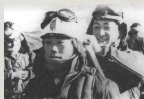
Japanese kamikaze pilots prepare for a mission, 1944.

18 April Lt. Col. James H. Doolittle leads 16 B-25 bombers from carrier Hornet to bomb targets in Tokyo, Yokohama, Yokosuka, Kobe, and Nagoya. 7 May Gen. Jonathan Wainwright, MacArthur's successor in the Philippines, surrenders Corregidor and all U.S. troops under his command. 4–8 May Battle of the Coral Sea. This Japanese tactical victory but strategic defeat is the first naval battle in which all fighting is done by carrier-based planes and the opposing ships never saw each other. 3–6 June Battle of Midway. This American victory deals the Japanese their first major naval defeat and proves the offensive power of aircraft carriers. 7 June Japanese occupy Attu and Kiska in the Aleutian Islands.