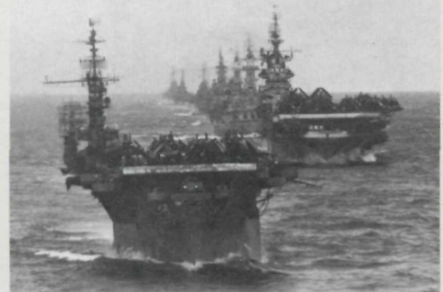
U.S. Navy task group returns to anchorage for repairs and supplies after strikes against the Japanese in the Philippines, December 1944.

7 December Without warning, Japanese planes bomb Pearl Harbor and Hickam and Wheeler airfields on Oahu, and within 30 minutes destroy the power of the U.S. Pacific battle fleet—except for aircraft carriers Enterprise , Lexington , and Saratoga , which are at sea. Japan declares war on the United States and Great Britain. The Pacific war that the United States suddenly found itself embroiled in had begun many years before the attack on Pearl Harbor when Japan, lacking the raw materials for modern industrialization, looked to mineral-rich Manchuria to supply them. Japanese attacks on China led to open warfare in July 1937. As a result of Japan's involvement in China and the extension of Japan's "Greater East Asia Co-Prosperity Sphere" into Indochina, the United States, Great Britain, and other countries froze Japanese assets and exports, threatening Japan's industrial survival. This led to accelerated Japanese economic expansion into Southeast Asia and the Dutch East Indies, bringing it into direct conflict with western countries that also had economic interests in these areas. By 1941 Japan was committed to a policy of aggression to achieve its goals. Japan's inability to come to diplomatic terms with the United States, which it saw as its most formidable opponent, led to the Pearl Harbor attack. 8 December Congress declares war on Japan; Japanese bomb islands of Wake and Guam, and