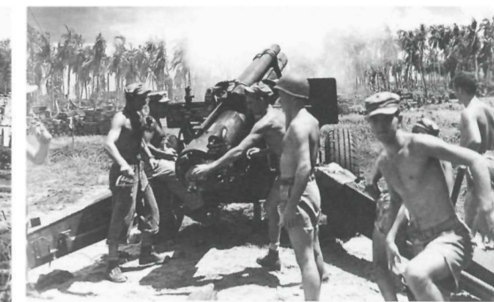
Marines of the III Amphibious Corps Artillery fire one of their 155-mm howitzers in support of the 305th Infantry's attack on the Orote Peninsula, July 22-24, 1944.