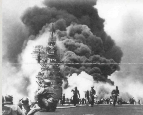
Crew of carrier USS Bunker Hill battles fires resulting from kamikaze attack during Okinawa campaign, 1945.

2 January Japanese occupy Manila. 7 January Siege of Bataan begins. MacArthur, headquartered on Corregidor, proclaims the Bataan Peninsula the center of American-Filipino resistance to the Japanese invasion of the Philippines. But its jungles, swamps, and mountains make supply difficult, and the Bataan Defense Force suffers shortages of food and medicines throughout the three-month ordeal. 1 February U.S. Navy launches air and surface attacks against Japanese bases in the Marshall Islands. 15 February Singapore surrenders. 27–28 February Battle of Java Sea results in most severe U.S. naval losses since Pearl Harbor and leads to the collapse of organized Allied military resistance in that area.