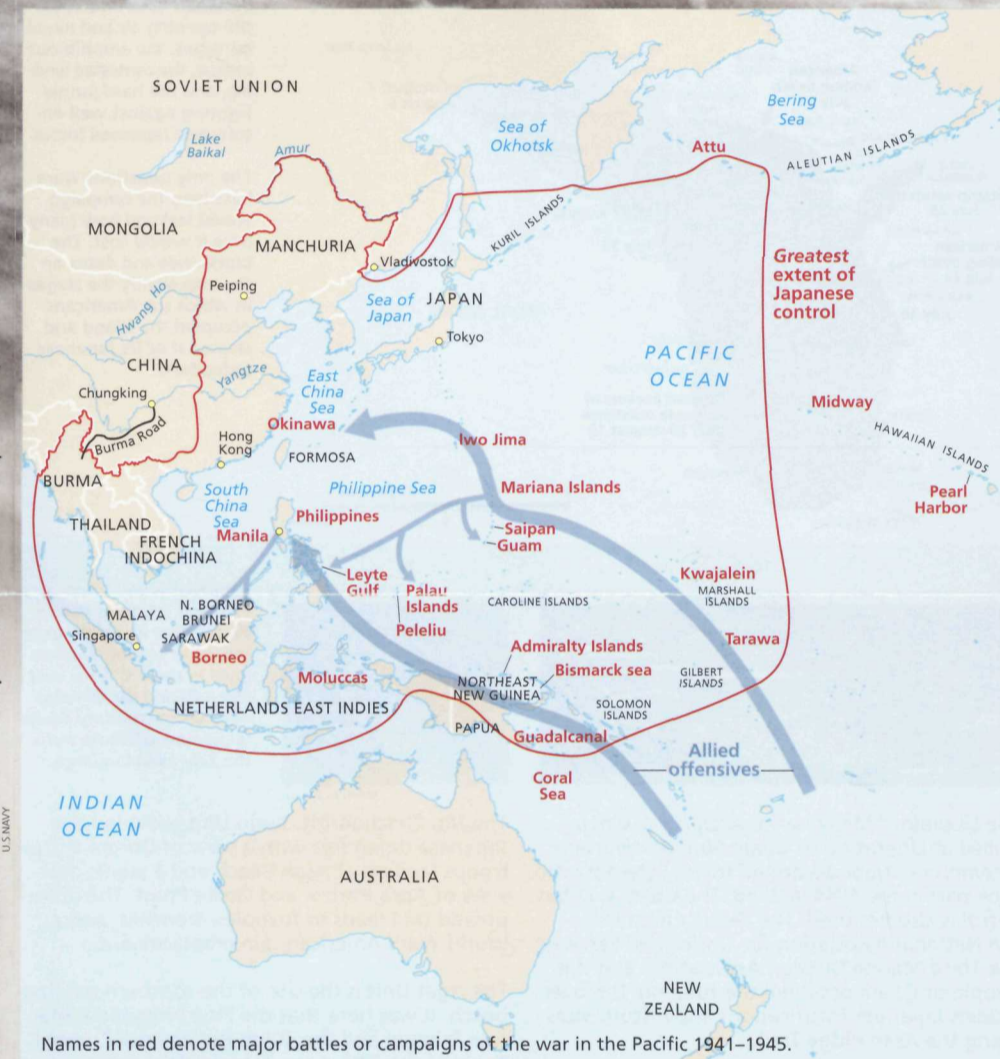
Names in red denote major battles or campaigns of the war in the Pacific 1941–1945.

22 July Papuan Campaign begins as Japanese troops land at Gona and Buna, 100 miles east of Lae and Salamaua in northern New Guinea, and begins an overland drive across the Owen Stanley Mountains to capture Port Moresby on the southern coast. In the months that follow, Australian and U.S. forces frustrate every attempt to take the port and eventually drive the Japanese back to Gona and Buna. 7 August U.S. Marines invade Guadalcanal in the Solomon Islands in the first American offensive of the war. Subsequent Japanese efforts to drive the Americans off the island are consistently unsuccessful.