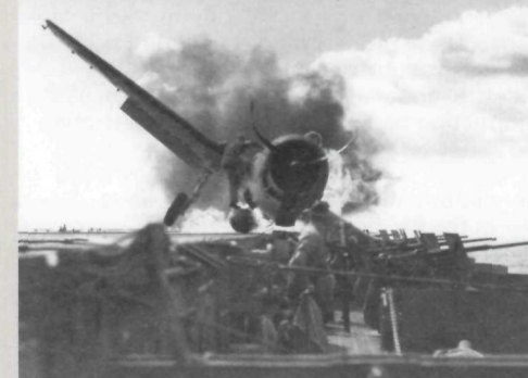
Navy officer scrambles to aid a Hellcat pilot who has crash landed on the deck of the carrier USS Enterprise , 1944.

10 January U.S. troops begin final offensive to clear Guadalcanal. By February 9 organized Japanese resistance on the island is ended. The American victory opens the way for other Allied gains in the Solomons. 22 January Papuan Campaign ends in the first decisive land defeat of the Japanese.