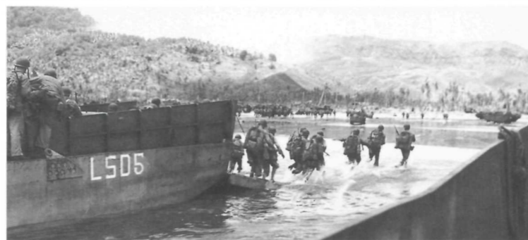
Assault troops of the 3rd Marine Division wade ashore under fire at Asan Beach, July 21, 1944.