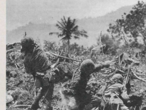
U.S. Marines hurl grenades at Japanese positions in the fighting on Saipan, 1944.

26 March An indecisive naval battle off the Komandorski Islands prepares the way for reconquest of the Western Aleutians. By mid-August Japanese troops have been driven out of both Attu and Kiska. 5 August Munda Airfield, New Georgia, is captured, providing Allied forces a base from which to bomb Japanese air and naval facilities at Rabaul. 25 August Americans overrun New Georgia, Solomon Islands, thus removing the Japanese threat to forces on Guadalcanal. 20 November Admiral Nimitz's Central Pacific offensive to reconquer the Marshall, Gilbert,