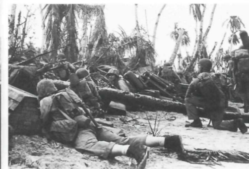
Marines take cover behind bomb and shell debris and fallen coconut trees, July 1944.