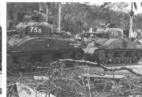
U.S. Army tanks of the 77th Infantry Division take a few moments' rest to view the damaged ruins of Agana (now Hagåtña).