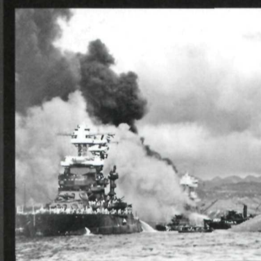
USS Maryland and capsized USS Oklahoma, Dec. 7, 1941