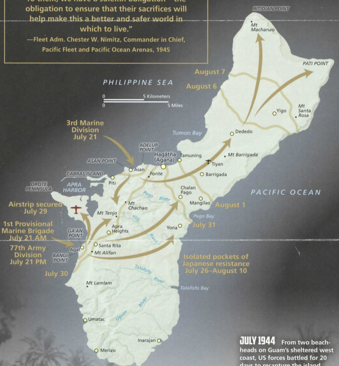
JULY 1944 From two beachheads on Guam's sheltered west coast, US forces battled for 20 days to recapture the island. Gold arrows show the general direction of the American assault.

—Fleet Adm. Chester W. Nimitz, Commander in Chief, Pacific Fleet and Pacific Ocean Areas, 1945