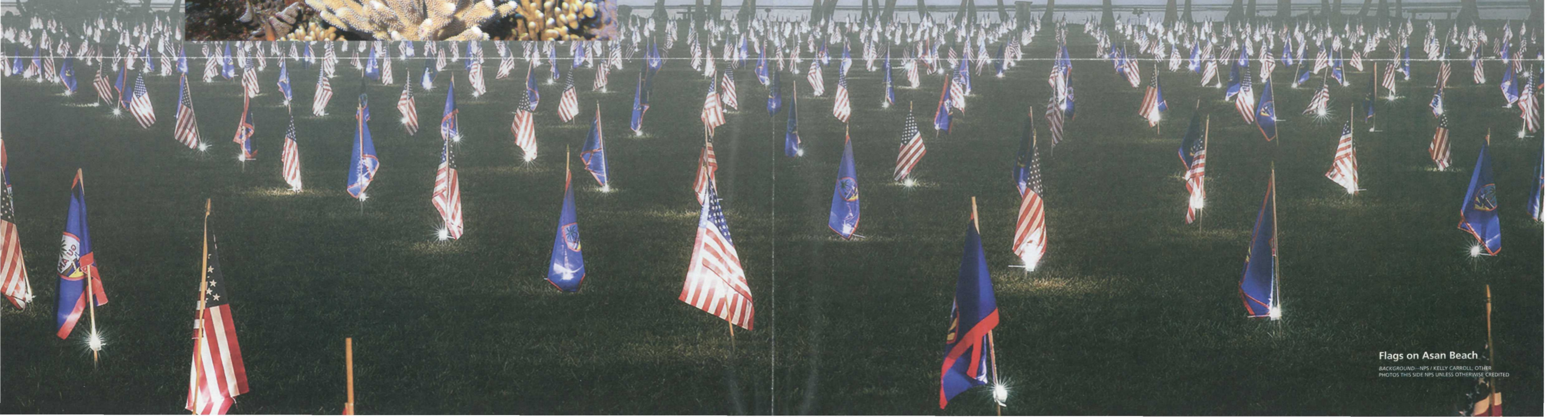
Flags on Asan Beach

As you explore the park's lands and waters, keep in mind your role as a steward of these irreplaceable treasures.