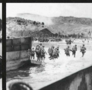
3rd Marine Division taking Asan Beach, July 21, 1944