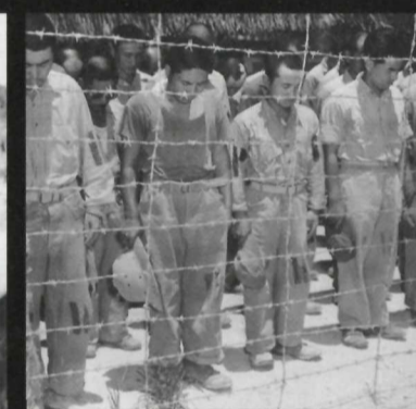
Japanese prisoners of war, 1945