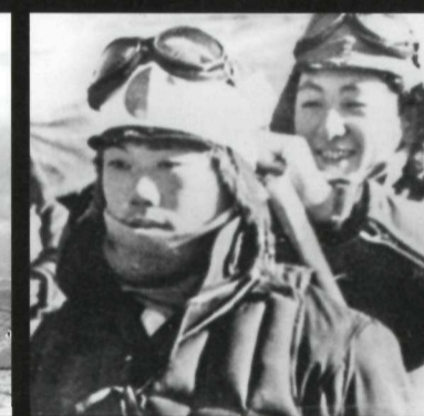
Japanese kamikaze pilots prepare for a mission, 1944