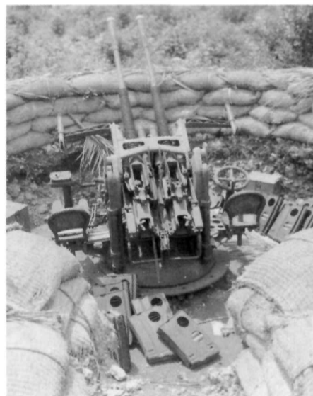
Visitors to Ga'an Point can view a Japanese 25-mm gun and a 200-mm gun used in battle, similar to those in these historic photographs.

both well-conceived and well-concealed, as the engineers were masters at using the natural environment to their advantage. Also wielded to the Japanese advantage were Chamorro laborers, who, forced under threat of punishment, constructed fortifications like these. Embedded on the concrete wall of the blockhouse is the inscription of the engineering company that oversaw the completion the structure.