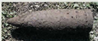
Navy 5" Projectile