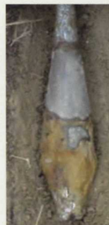
High Explosive Mortar*