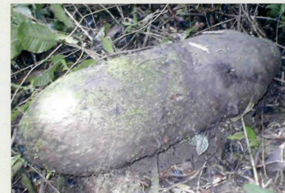
General Purpose Bomb