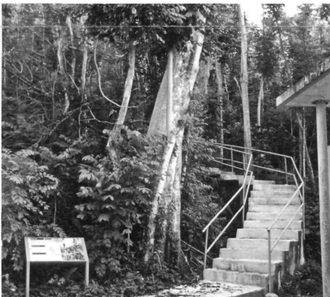
Your hike begins behind the church social hall. Please use caution as the trail and stairs may be slippery.

Follow the road for approximately half a mile, and park on the far side of the church social hall. The trailhead is just behind the wayside exhibit panel at the base of the hill. The trail ascends steeply through thick coastal jungle, reminiscent of the challenging terrain negotiated by both Japanese and U.S. troops.