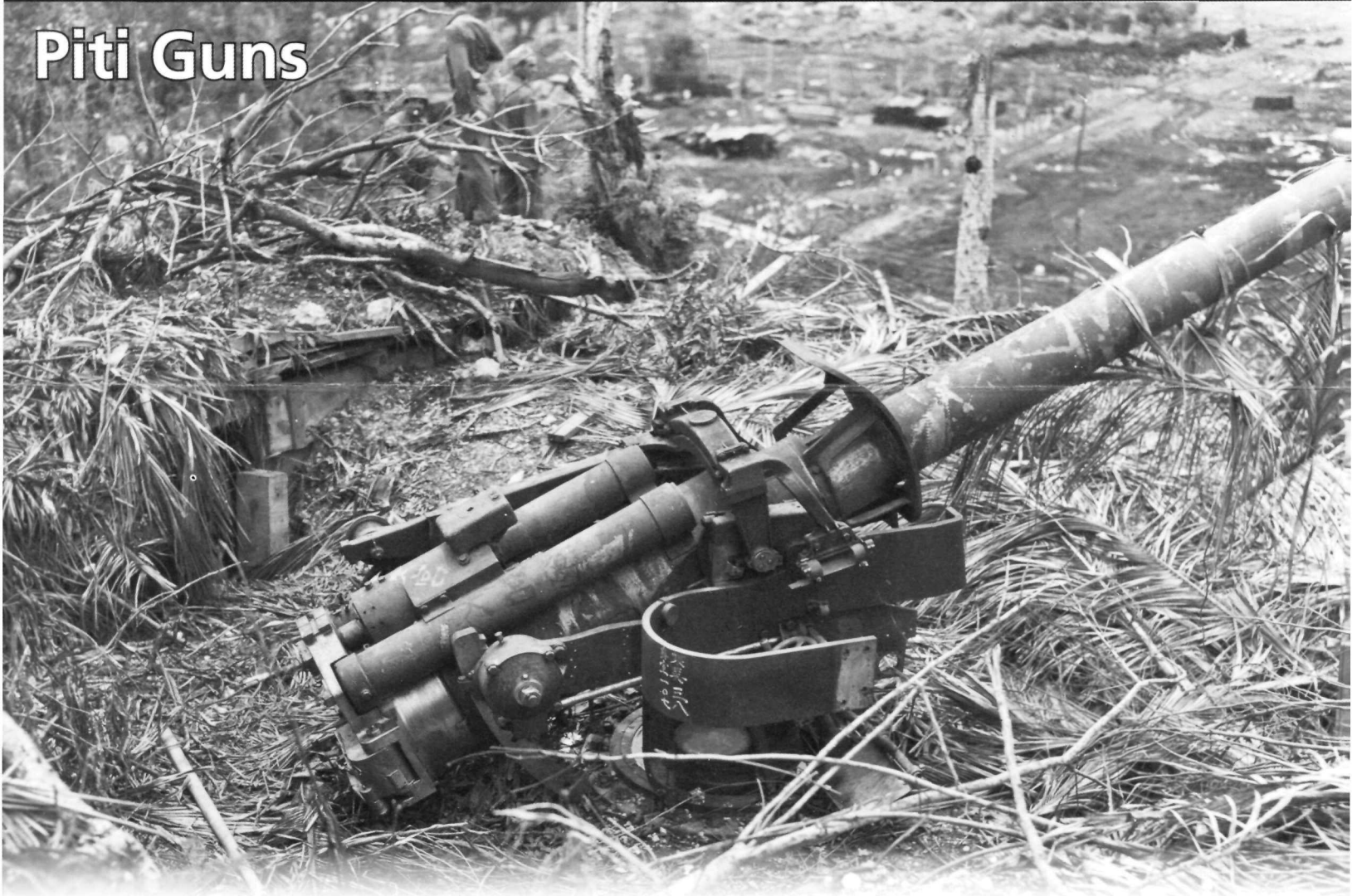
October 5, 1944: A Japanese Vickers-type Model 3 (1914) 140-mm (5.5 inch) coastal defense gun stands intact over the ruins of Piti.

The Japanese defenders heavily fortified the terrain surrounding Guam's coasts and cliffs, in preparation of America's return to the island. The American landings began on July 21, 1944. Weeks of heavy bombardment and intense fighting took their toll on the island, destroying homes, burning vegetation, and damaging fortifications. But above the hills of Piti, three Japanese coastal defense guns still rest silently within a mahogany forest. They are the only guns War in the Pacific National Historical Park protects that remain in their original emplacements.