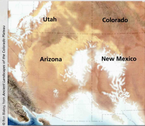
Extent of the Permian Sea about 250 million years ago

Over millions of years, sea levels rose and fell many times. In times of evaporation, concentrations of calcium and sulfate in the water increased enough to combine and form the mineral gypsum ( \text{CaSO}_4 \cdot 2\text{H}_2\text{O} ). Thick layers of gypsum were deposited in sedimentary rocks on the bottom of this sea.