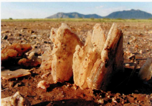
Selenite crystals on the surface of Lake Lucero

Each year some of the crystals emerge from the protective mud surface of Lake Lucero as wind and rain remove sediments from around them. Once exposed, crystals begin the gradual process of erosion into smaller and smaller pieces.