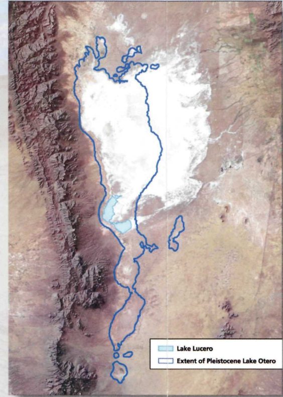
Lake Otero once covered much of the Tularosa Basin. When it dried, gypsum deposits were left behind on the basin floor.

Two to three million years ago the ancient Rio Grande flowed along the southern edge of the Tularosa Basin. Sand deposits from the river blocked-off the southern edge of the basin, preventing snowmelt and rainfall from flowing out of it. This allowed for the formation of the 1,600 square-mile Lake Otero.