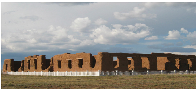
Fort Union National Monument

June 28, 1954 Fort Union National Monument is created by Act of Congress.