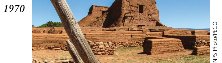
Pecos National Historic Park

June 28, 1965 Pecos National Monument is created by Act of Congress.