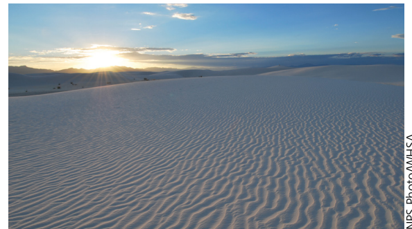
White Sands National Monument

January 18, 1933 White Sands National Monument is created by proclamation of President Herbert Hoover.