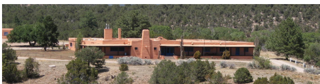
Pecos National Historic Park

July 2, 1991 Pecos National Monument is enlarged with additional lands and renamed Pecos National Historical Park.