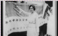
Alice Paul 1923