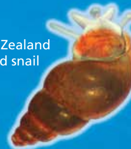
New Zealand mud snail