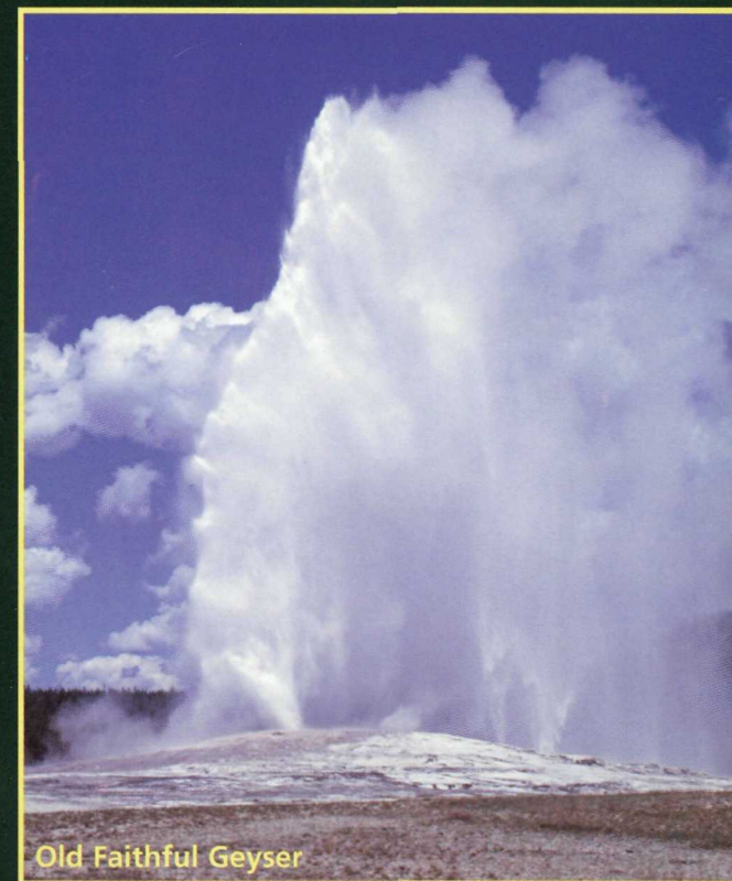
Old Faithful Geyser