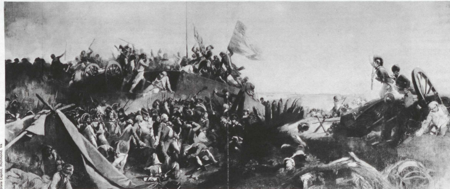
The Storming of Redoubt No. 10, October 14, 1781. From the painting by Louis Eugene Lami, 1840, showing General Lafayette's Light Infantry overrunning the British fieldwork.

always short-lived. The men who filled the Continental ranks suffered a sorry day-to-day existence of too little food, too little clothing, and too much disease—an existence that was interrupted only by the exciting agony of battle.