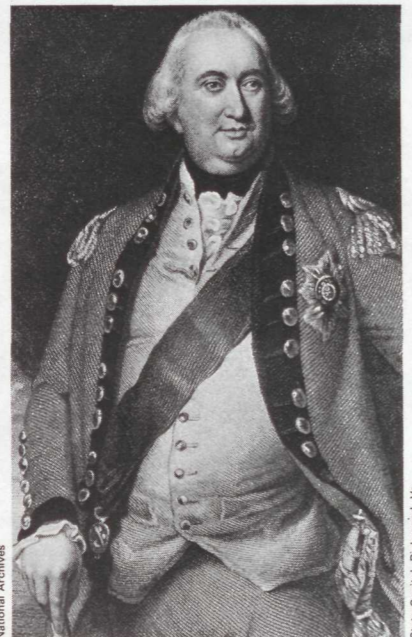
Lt. Gen. Charles, Lord Cornwallis, commander of the British forces surrendered at Yorktown. From an early engraving.

The American War for Independence culminated in the battle fought in and around the town of York in 1781. From this came a new nation, the United States of America, and a deeper understanding of liberty and freedom in the western world.