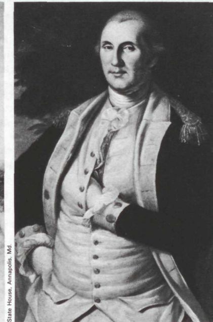
Gen. George Washington, commander of the allied French and American army at Yorktown. From the painting by Charles Willson Peale.

thought the York River would provide suitable opportunity for either reinforcement or withdrawal, with aid from the British Navy.