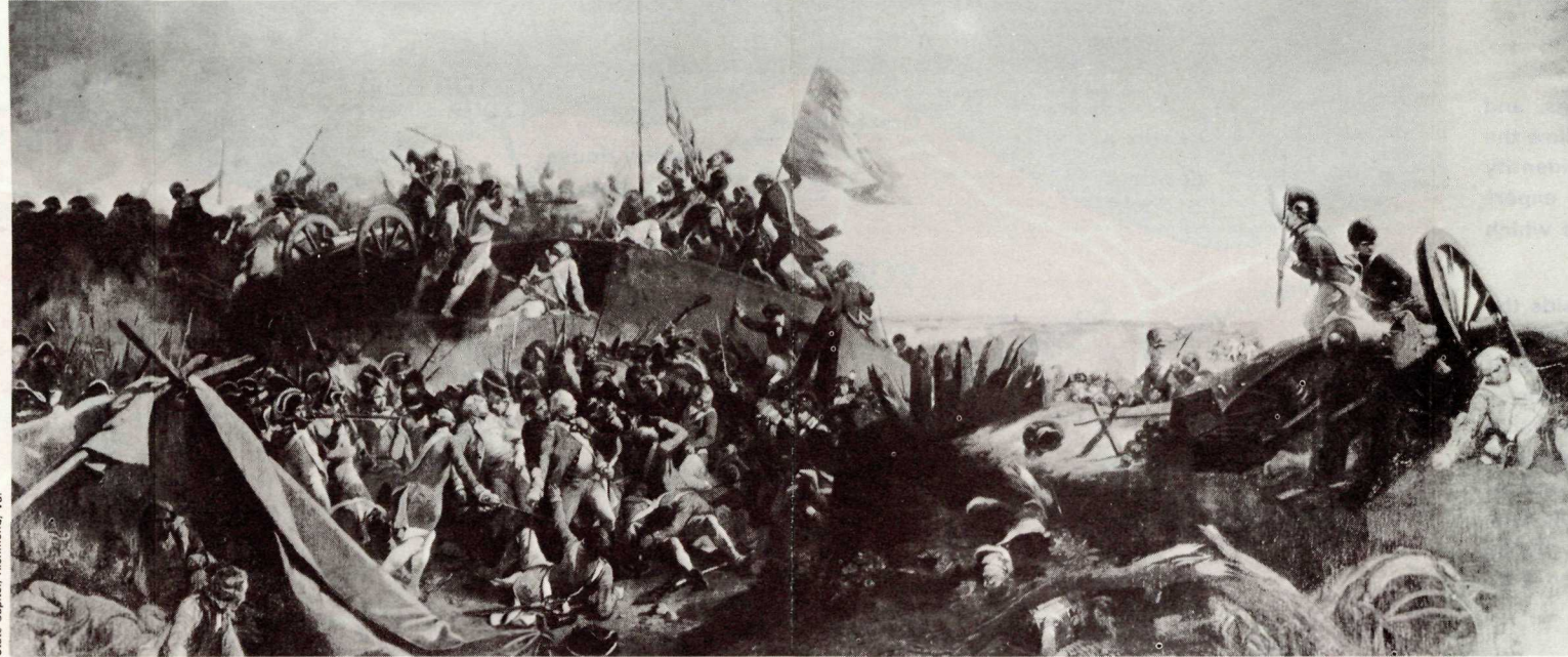
The Storming of Redoubt No. 10, October 14, 1781. From the painting by Louis Eugene Lami, 1840, showing General Lafayette's Light Infantry overrunning the British fieldwork.