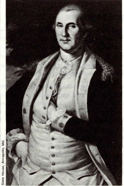
State House, Annapolis, Md.

The American War for Independence culminated in the battle fought in and around the town of York in 1781. From this came a new nation, the United States of America, and a deeper understanding of liberty and freedom in the western world.