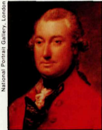
"Charles Earl Cornwallis" by Gainsborough, 1783.