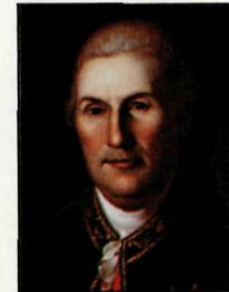
"Comte de Rochambeau" by C. W. Peale, 1782.