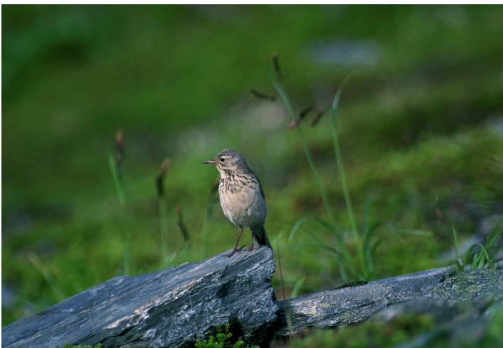
Figure 4. American pipits breed in Sierra Nevada alpine meadows. It is uncertain how a warming climate will affect these birds, but alpine environments are among the most vulnerable to climate change impacts.