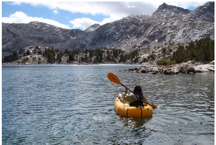
Figure 7. Biological technician paddles out to collect mid-lake water temperature profiles and a water sample in Kings Canyon National Park.