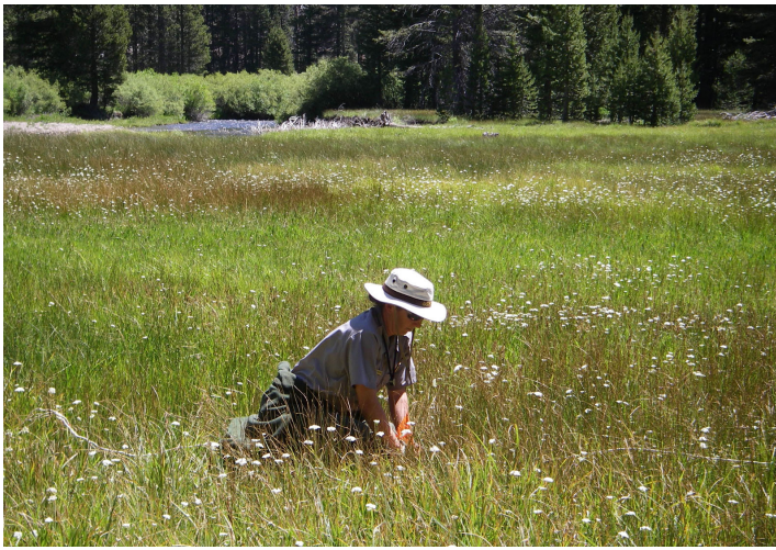
Figure 9. Botanist installs a wetland monitoring plot in Devils Postpile National Monument.