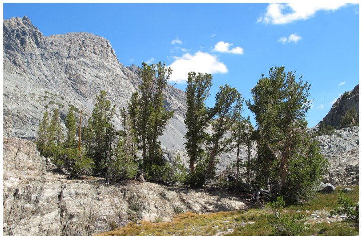
Figure 6. Whitebark pine ( Pinus albicaulis ) in Kings Canyon National Park. Whitebark pine is showing severe declines in much of its range and the species is currently warranted for listing as a federal endangered species.

The SIEN parks contain the headwaters and large portions of seven major Sierra Nevada watersheds—the Tuolumne, Merced, San Joaquin, Kings, Kaweah, Kern and Tule. The distribution and movement of water and its interactions with the surrounding environment, or hydrology, will be monitored in a subset of major rivers to better understand how water dynamics change seasonally and over long time periods. Climate-related changes in snowpack and snowmelt patterns have major effects on river flow patterns. Figure 8 shows the greater variability of hydrologic patterns that are already occurring or anticipated to occur with expected temperature increases. A recent assessment of local stream gages and snow courses indicated that snowmelt is occurring earlier, and less of the total stream discharge is occurring between April and July when most of snowmelt runoff has historically occurred (Andrews 2011). Monitoring of river flow patterns helps park and water managers to better understand and predict the timing of the delivery of snow runoff as well as the effects of climate change.