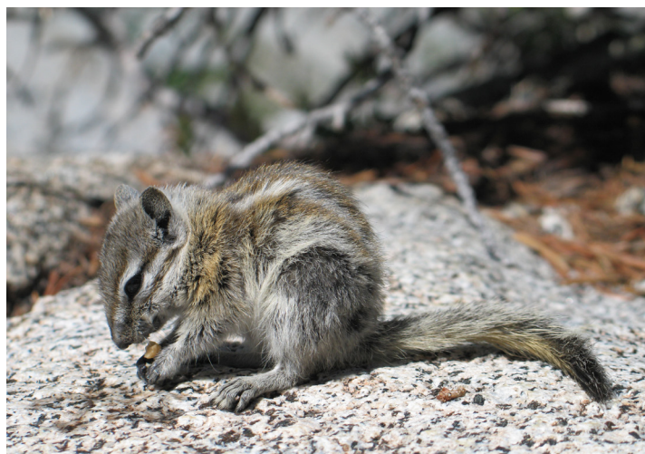
Figure 2. Alpine chipmunk ( Tamias alpinus ), a high-elevation species endemic to the Sierra Nevada, has shown contraction of its lower range.