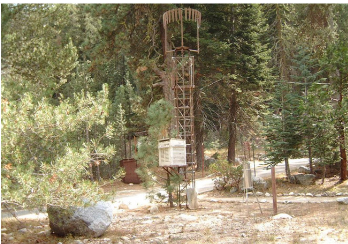
Figure 5. Weather station in the Lodgepole area, Sequoia National Park -- one of the National Weather Service COOP stations that will be used in SIEN's climate monitoring project.