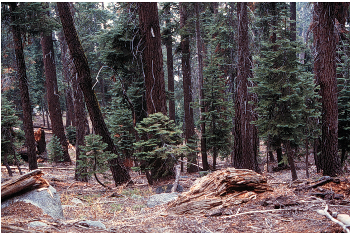
Figure 3. Long-term monitoring plot in red fir forest, Sequoia National Park - one of 30 forest monitoring plots currently monitored by the USGS Sequoia-Kings Canyon Field Station.